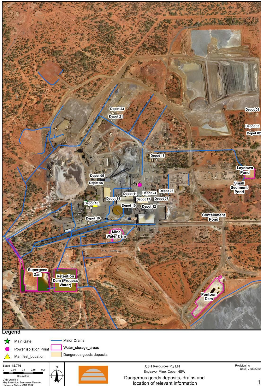
Figure 11-1: Hazardous Substance Location Map