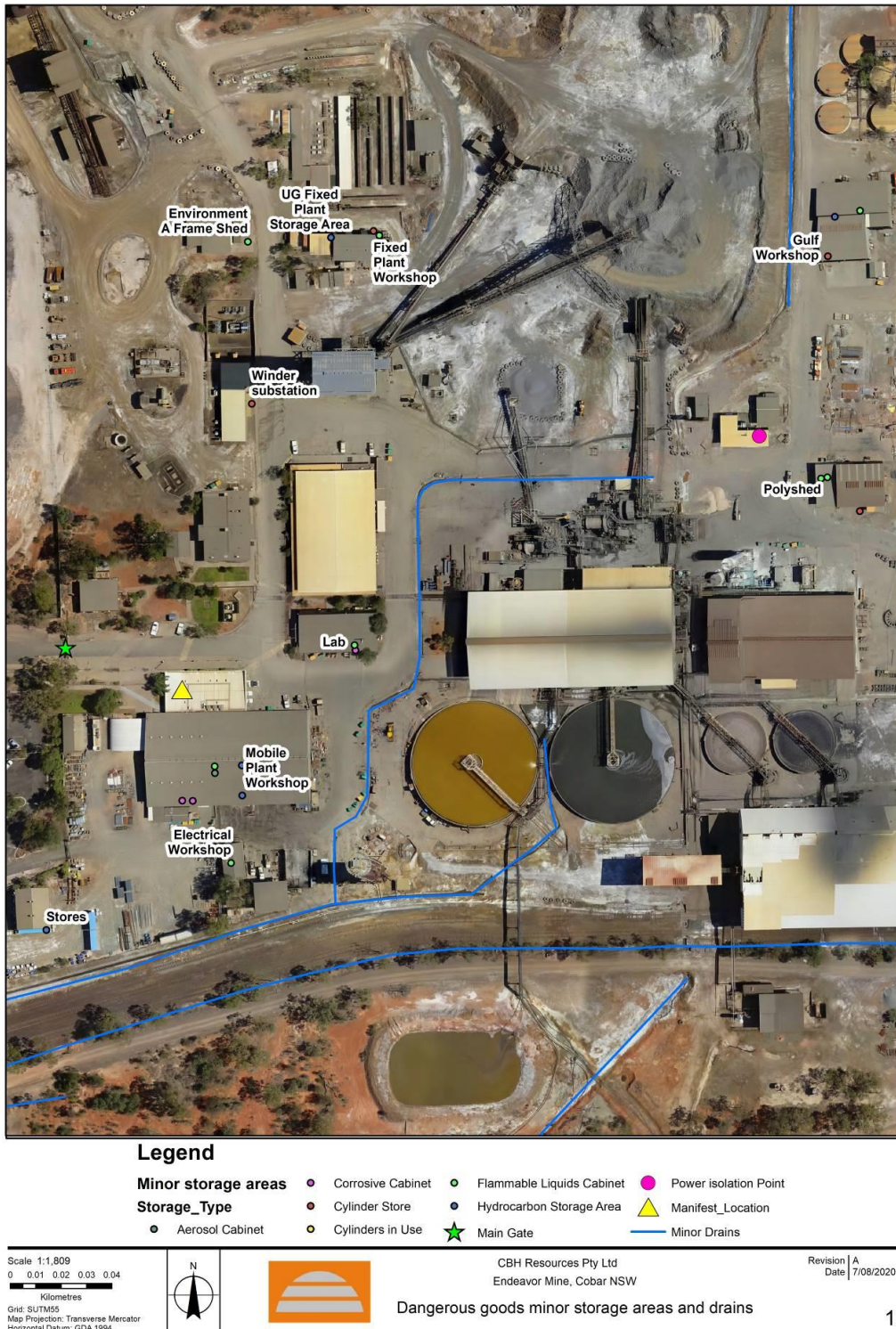
Figure 11-2: Dangerous Goods Stores