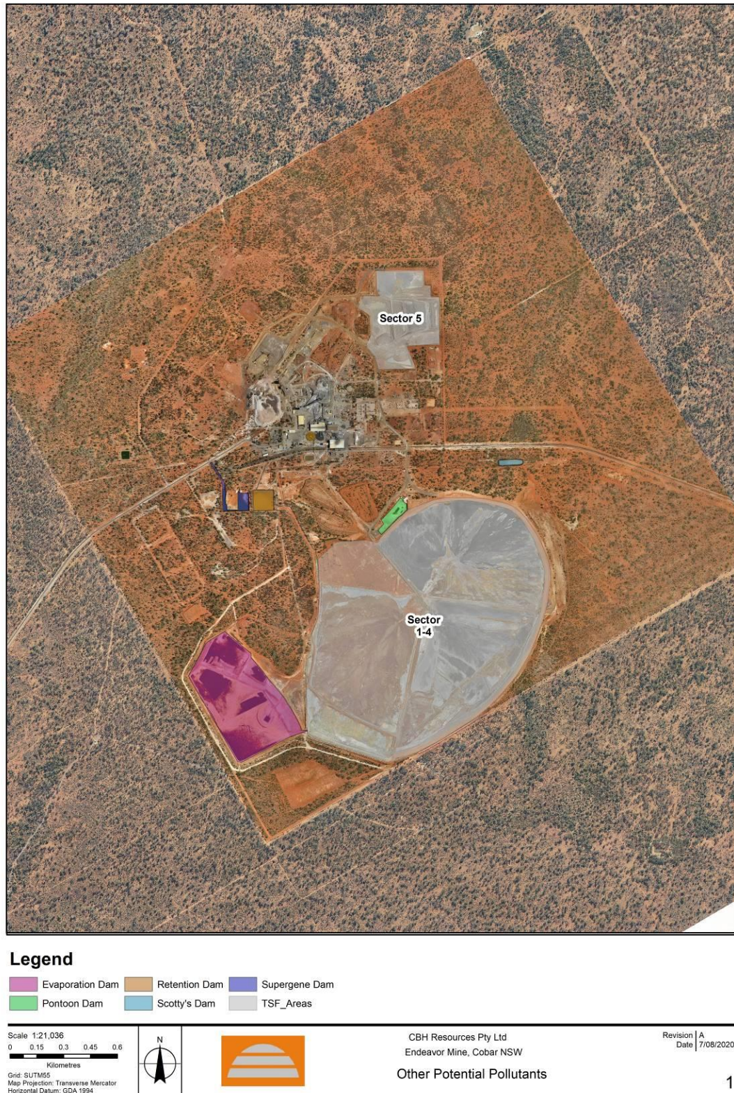
Figure 11-3: Other Pollutant Locations