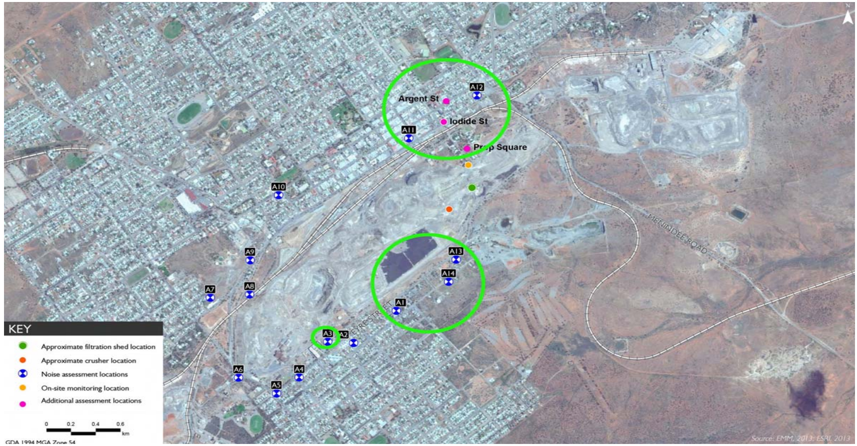
Figure 5 Noise monitoring locations