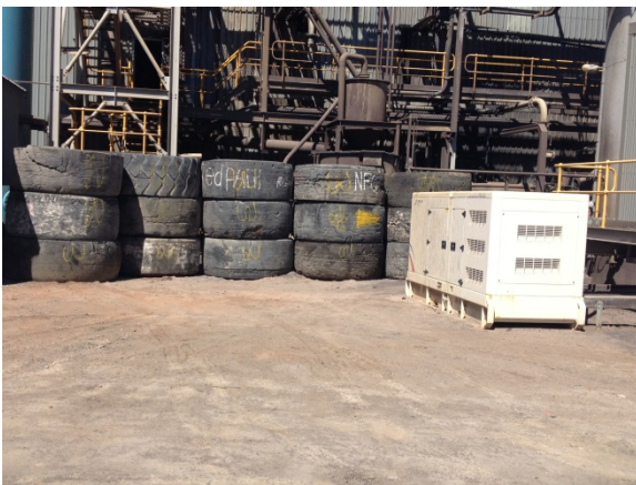
Figure 4 Tyre bund around filtration shed pipework