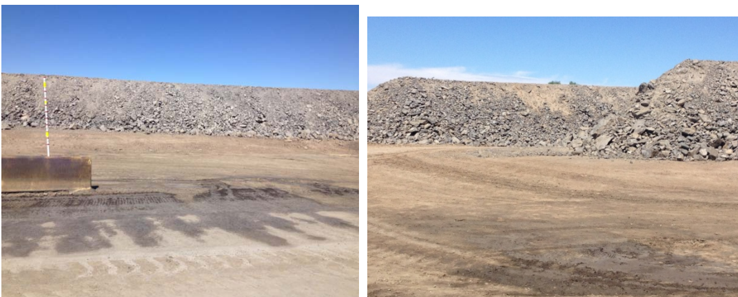
Figure 1 Overlapping windroses on access route to old tailings storage facility (TSF)

Some images of these works are provided in Figure 1 to 4.