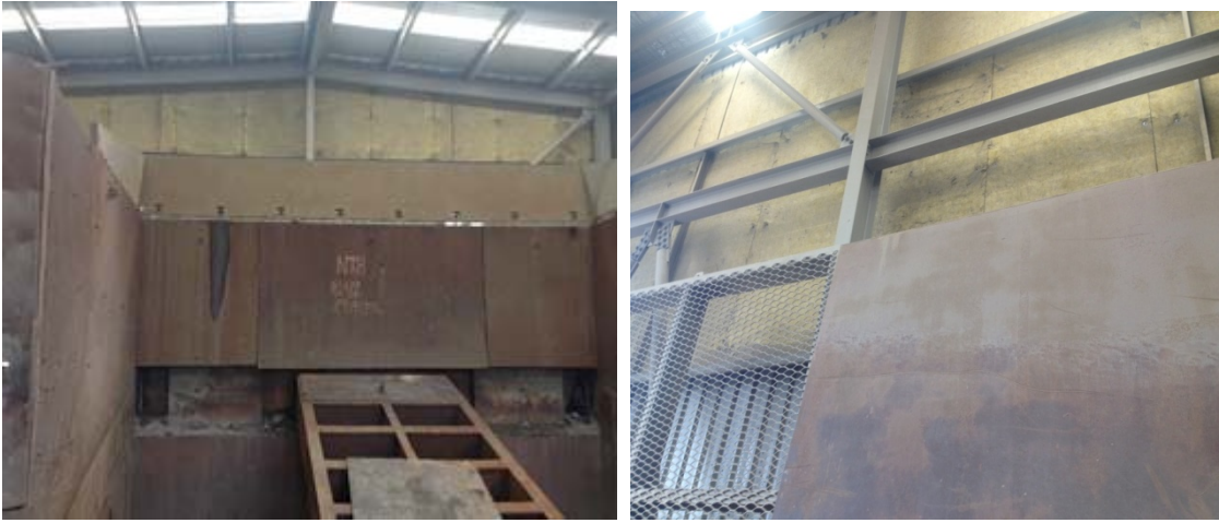
Figure 2 Noise insulation in crusher building (50mm glasswool)