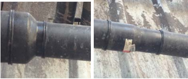
Figure 3 Pipework done to reduce noise from orifice plate