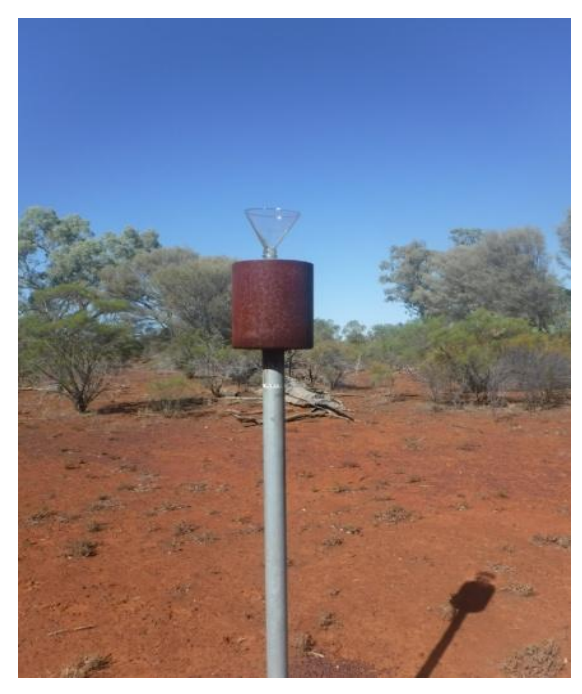
Figure 2.1 Dust monitoring gauge located in the project

Nevertheless, dust deposition on and beyond the boundary of the lease has the potential to cause environmental harm. Therefore Endeavor Mine manages airborne contaminants on site through the use of water sprays and a water trucks with depositional dust monitoring stations strategically located along the boundary of ML158/159/160/161 to measure performance.