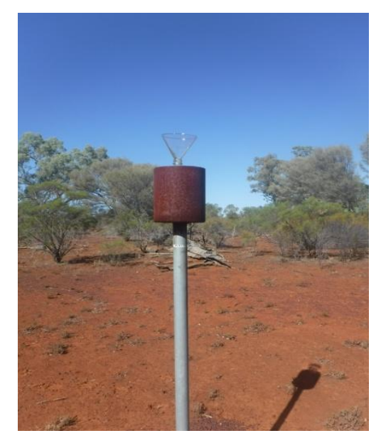
Figure 2.1 Dust monitoring gauge located in the project

Nevertheless, dust deposition on and beyond the boundary of the lease has the potential to cause environmental harm. Therefore Endeavor Mine manages airborne contaminants on site through the use of water sprays and a water trucks with depositional dust monitoring stations strategically located along the boundary of ML158/159/160/161 to measure performance.