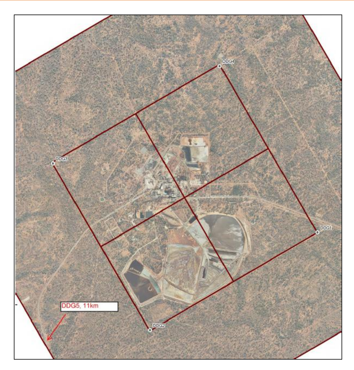
Figure 2.2 Endeavor Mine Dust Monitoring Locations